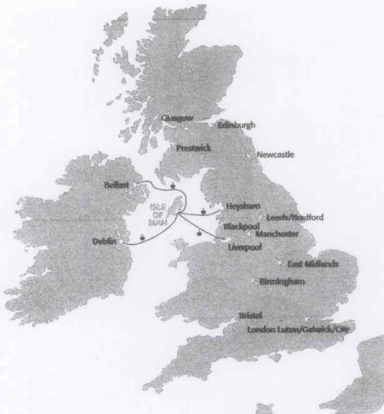
The Island in the Irish Sea